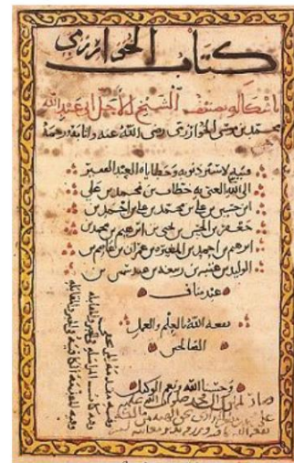
Figure 2 A page from Al Khawarizmi "Algebra"

and provided practical examples of how to use algorithms to solve mathematical problems such as calculating the area of geometric shapes or finding square roots.